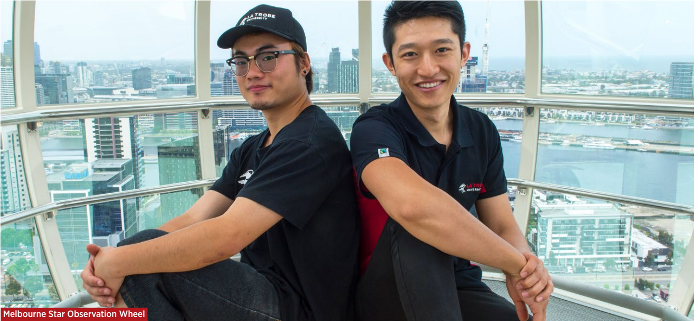
Melbourne Star Observation Wheel

With music, art, food and sport, this is where it's all happening.